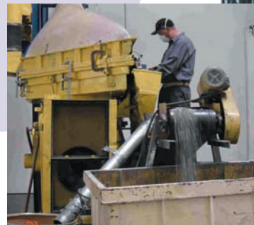
Electronics Partners Corporation (ePC), E-Waste Processor, RMDZ Loan Recipient