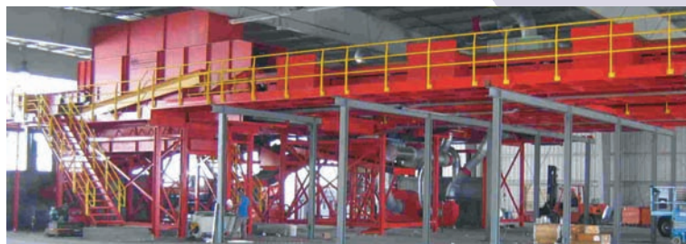
Looney Bins, Construction and Demolition Material Processor, RMDZ Loan Recipient

For more information regarding the City of Los Angeles RMDZ program, please contact the RMDZ Administrator at (213) 485-3904 or (213) 485-3884, or visit our website at www.lacity.org/san/srcrd .